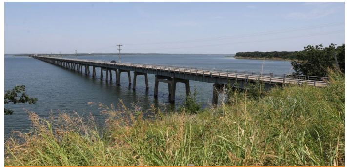
The US-70/Roosevelt Bridge replacement over Lake Texoma between Durant and Kingston, will begin in 2026 as part of the 2025-2032 Eight-Year Construction Plan

This marks the 22nd edition of the Eight-Year Construction Plan. Since its inception, ODOT has made major impacts to the safety and quality of the state’s transportation system. Oklahoma’s number of structurally deficient bridges has decreased from 1,168 bridges to fewer than 50, which are scheduled to be addressed in the Eight-Year Plan, and Oklahoma continues to rank in the top 10 in the nation for good bridge conditions. An interactive map showing all projects on both plans can be found on the ODOT homepage at odot.org , under “Programs and Projects” then “8-Year ODOT Construction Projects.” This tool allows users to easily locate projects and related information.