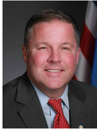
Senate President Pro Tempore-Designate Lonnie Paxton (SD 23)